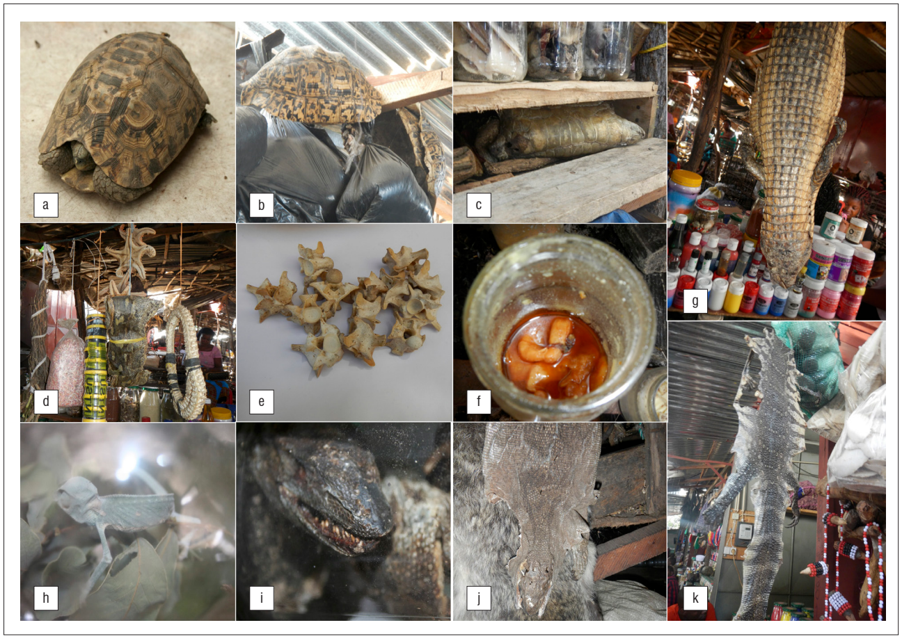
Figure 1: Reptiles recorded in the 2015/2016 Xipamanine and Xiquelene Market surveys. (a) Live Kinixys sp.; (b) Stigmochelys pardalis carapaces; (c) concealed Crocodylus niloticus skin; (d) Python natalensis skin and vertebrae (rolled up); (e) handful of Python natalensis vertebrae; (f) allegedly Python natalensis fat; (g) whole Broadleysaurus major; (h) live Chamaeleo dilepis dilepis in a plastic bottle; (i) Varanus niloticus in a container; (j) whole Varanus niloticus skin; (k) whole Varanus albigularis skin.

Our species count and the number of animals or body parts (Table 3) is likely to be an underestimation of actual numbers because live animals were generally concealed from view and were sometimes only shown on request of the accompanying AMETRAMO representative. The willingness of traders to disclose their stock in the 2016 survey was markedly reduced compared to 2015. Chauqúe<sup>5</sup> similarly noted that some animals are stored out of sight in Xipamanine and are only shown to potential customers. Our role as researchers would thereby have obviated any incentive for vendors to show us the species for sale.