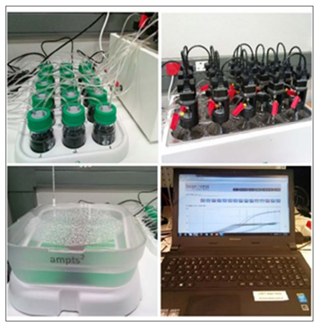
Figure 1: Biomethane potential assay with the data acquisition system.

The biomethane potential of okra waste process was performed in triplicate using the BMP assay (AMPTS II, Bioprocess Control, Sweden) with 500-mL reaction bottles at Bioprocess Laboratory, Mechanical and Industrial Engineering, University of South Africa, Florida Campus (Johannesburg, South Africa) as shown in Figure 1. Each reactor was filled to 400 mL of the total volume with the addition of 27.55 g okra based on 6.90% VS, 370.94 mL of inoculum (inoculum to substrate ratio was 2:1) and 1.51 mL of distilled water. Nitrogen gas (Afrox Gas, South Africa) was used to flush out oxygen from the reactors. The reactors were operated at mesophilic temperature ( 37 \pm 1 °C) for 25 days. The entire test was performed as stipulated by the AMPTS II standard operation manual. Results were retrieved from the data logging platform of the reactors and used for the calculation of daily biogas production, production rate and cumulative methane production, as shown in Table 2 and Figure 2.